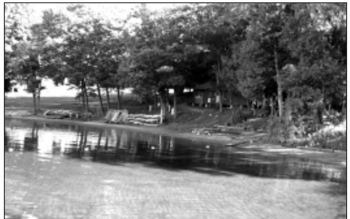
Kilcoo shoreline now