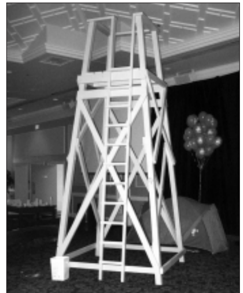
An exact replica beach tower was signed by the guests and will live at camp.