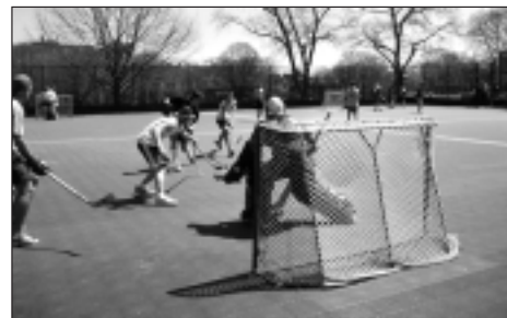
Intense play in the 2006 AMICI Ball Hockey Tournament

Team Elton is one of the original teams from the 2002 tournament, but have never been able to play in the final. After years of goaltending changes and roster moves the