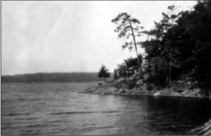
Chapel Point 1933