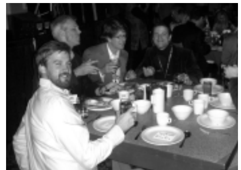
The "overflow" table