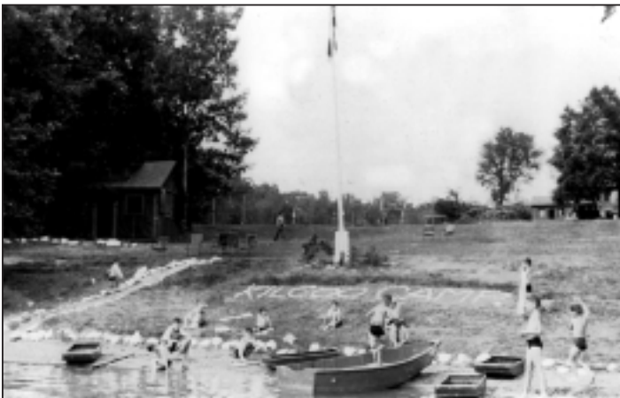
Kilcoo shoreline then