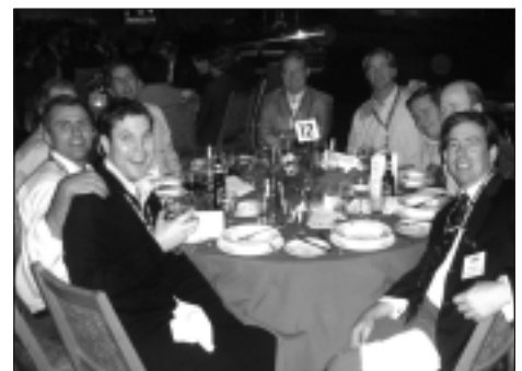
Happy alumni at dinner