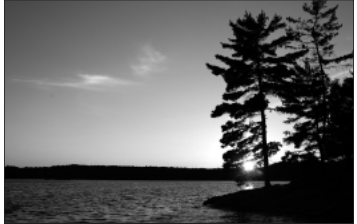
Chapel Point 2006